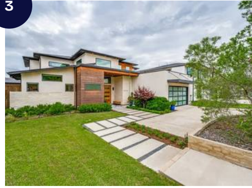
$2.1MM 1 Mile