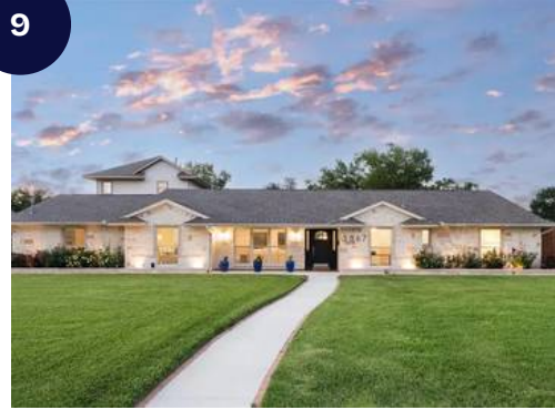
$1.8MM 0.5 Miles