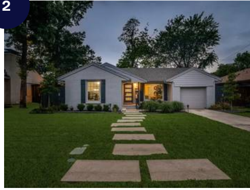
$675K 0.4 Miles