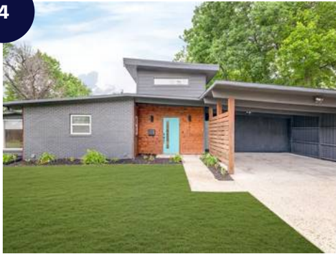
$650K 0.2 Miles