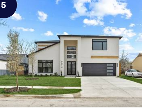
$1 MM 0.4 Miles