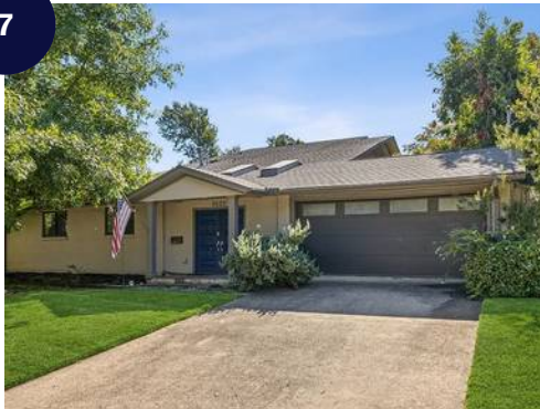
$775K 0.6 Miles