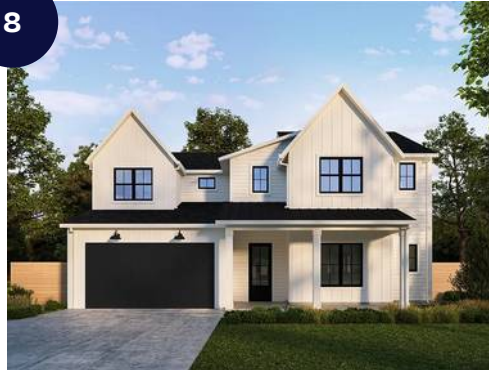
$1.6MM 0.9 Miles