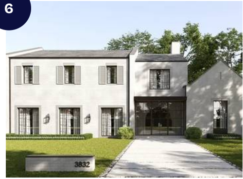
$3.6MM 0.8 Miles