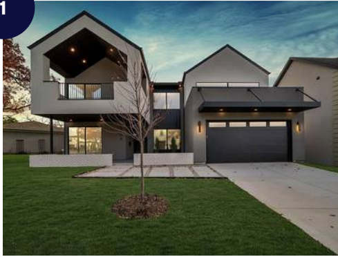
$1.8MM 0.4 Miles